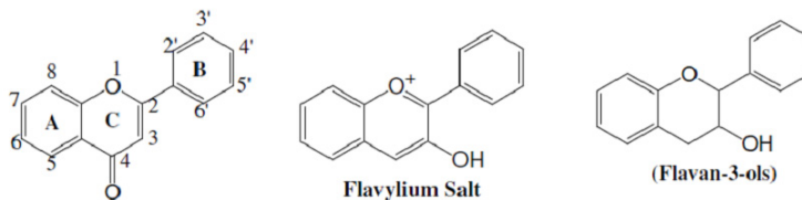
Figure 2. General structures for various classes of flavonoids