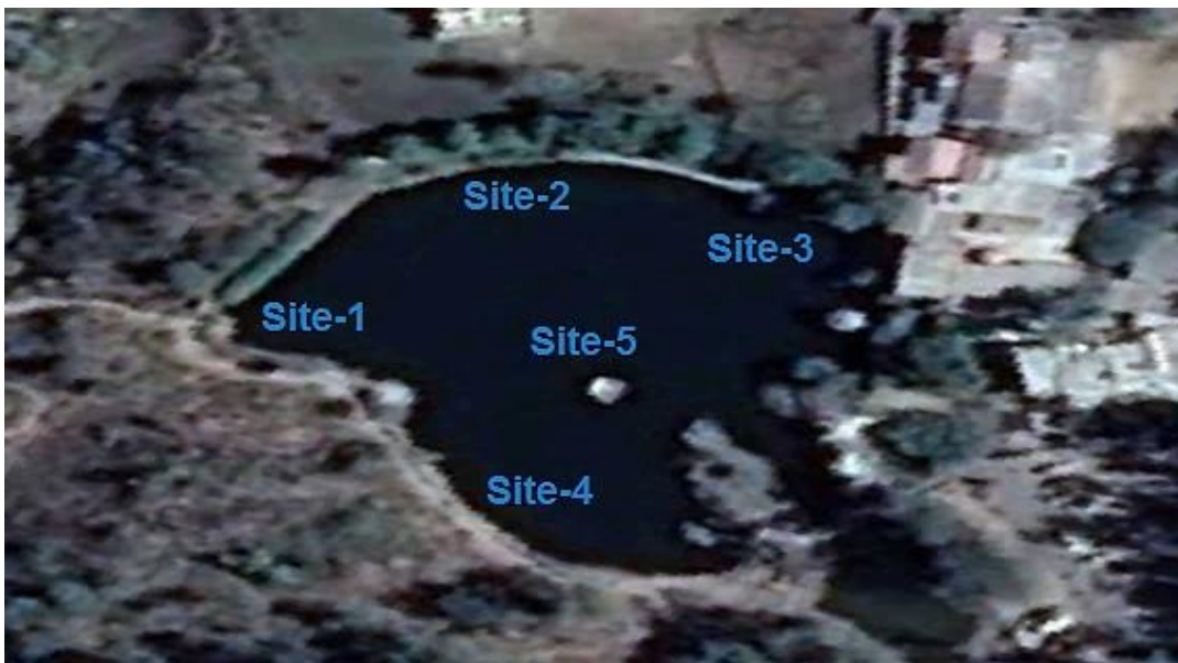
Figure 2. GIS view with zone and site specifications of Sant-Sarover, Mount Abu