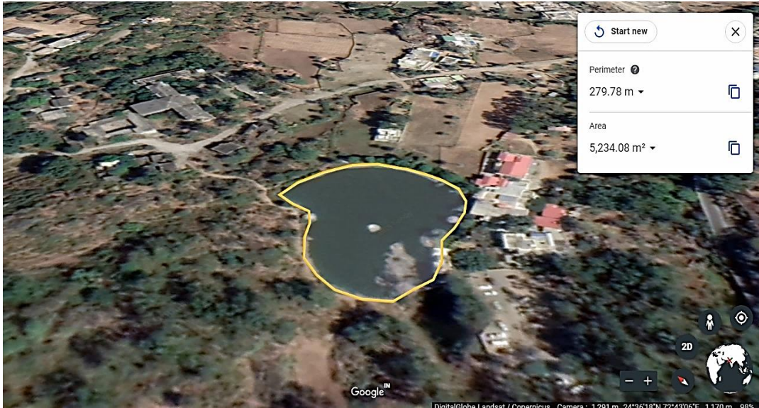
Figure 1. Total area by GIS of Sant-Sarover Pond, Mount-Abu