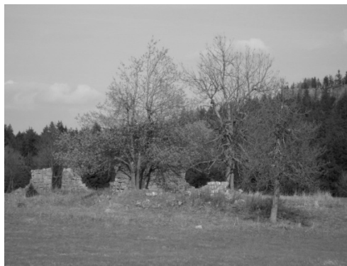
Fig. 1. The ruins of a farmstead in an abandoned village in the Stolowe Mts.