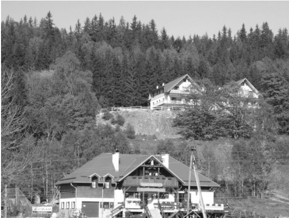
Fig. 5. Spread of new houses on steep slopes contributes to changes of slope profiles (building escarpments) and enhances the erosional processes – ski centre in Czarna Góra

The increase of recreation needs and their affordance among citizens in recent decades, resulted also in development of tourist infrastructure in the entire Sudetes region. At present, tourism is seen as a 'remedy' for the previous economic stagnation. In fact, the regional potential of tourism development, especially agrotourism, is very high (e.g. Wyrzykowski 2004, Potocki 2009). However, the natural values of the environment and landscape can be lost due to excess development of tourist infrastructure, such as new skiing areas, car parks, hotels and pensions, which can be observed already in some areas (e.g. Karpacz, Szklarska Poręba, Zieleniec, Czarna Góra).