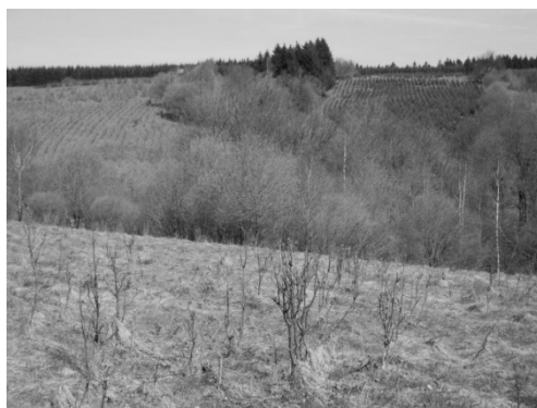
Fig. 3. Spontaneous secondary vegetation succession and forest plantations on former arable grounds in the Stolowe Mts.

of many various ecotones and increase of bio- and landscape diversity (Latocha, Migoń 2006). Additionally, the collapse of many ineffective and dilapidated industries resulted in general amelioration of the condition of the natural environment.