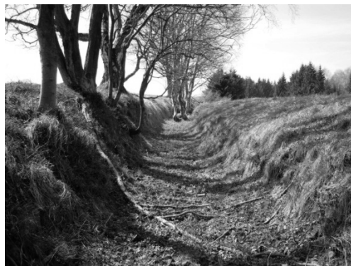
Fig. 2. Old field road – an inactive gully