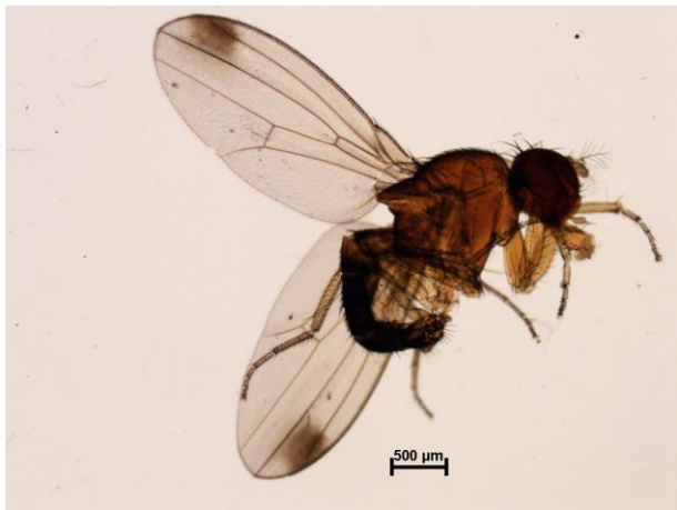
Fig. 3. D. suzukii male