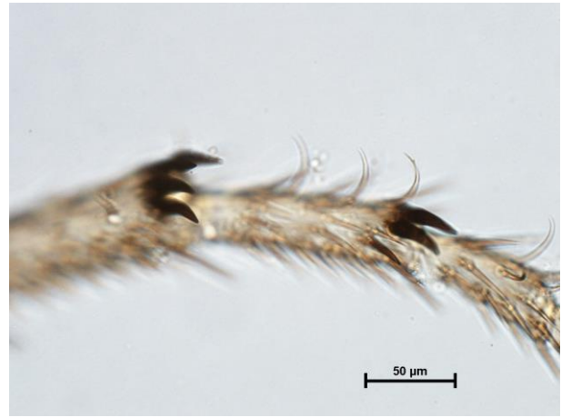
Fig. 4. Sex combs on forelegs tarsomere of D. suzukii male