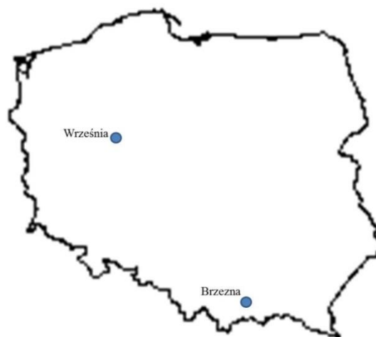
Fig. 7. Map showing where Drosophila suzukii was detected on the territory of Poland in 2014 (W. Piotrowski)

traps were wasps ( Vespula vulgaris L.), earwigs ( Forficula auricularia L.), houseflies ( Musca domestica L.). Sometimes, the number of other insects in Spanish traps was very high, which increased time needed for identification of D. suzukii .