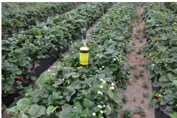
Fig. 5. Polish trap (prototype of Drosinal) at plastic tunnel (2014)