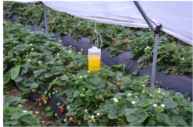
Fig. 6. Spanish trap (Cera Trap) at plastic tunnel (2014)