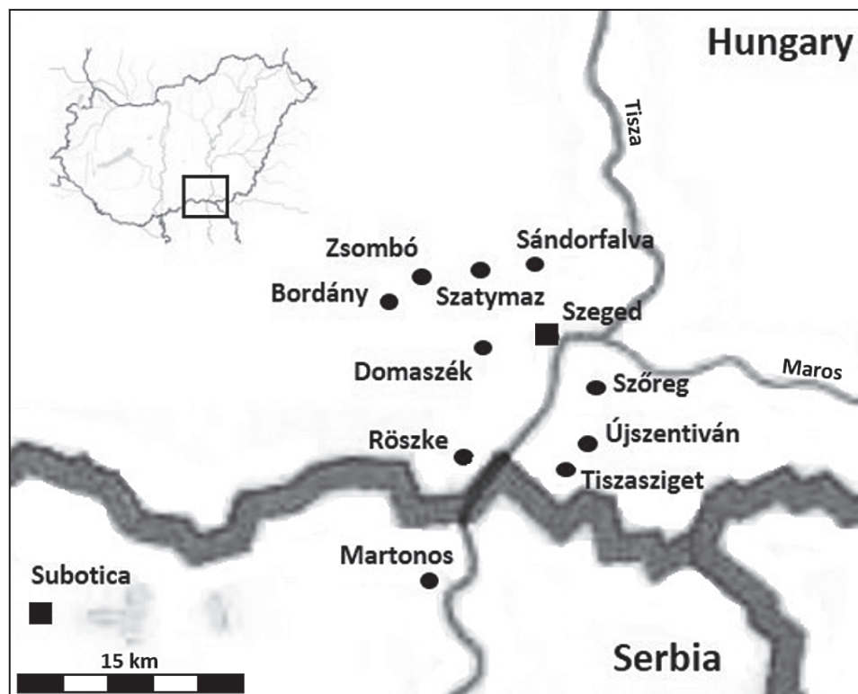
Fig. 1. Location of the sampling sites in Hungary and Serbia

Paprika samples were collected in 2013 and 2014 from the Szeged region (Figure 1). Samples were taken directly from farmers (Hungary: n = 12 ; Serbia: n = 4 ). Pepper plants were grown in fields on private farms, and were exposed to natural light, temperature, soil moisture and meteorological conditions. Fruits at harvesting maturity were used to make each of the tested dried sample. Soils in the Szeged region are mostly chernozem and meadow soils (BLASKÓ 2008). The investigated area has a continental climate and may be characterized with hot summers. In warm years, the mean annual temp.