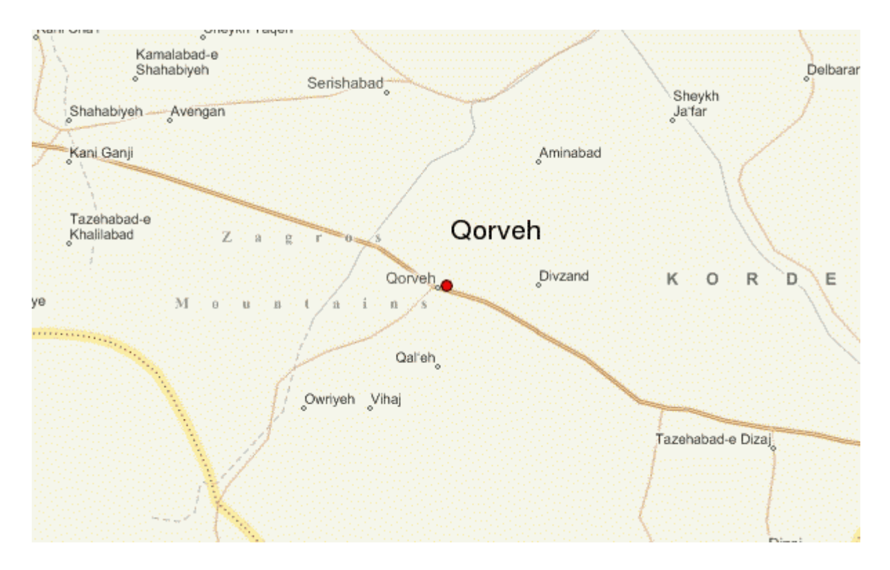
Figure 2. Qhorveh city, location map, Kordestān, Iran).