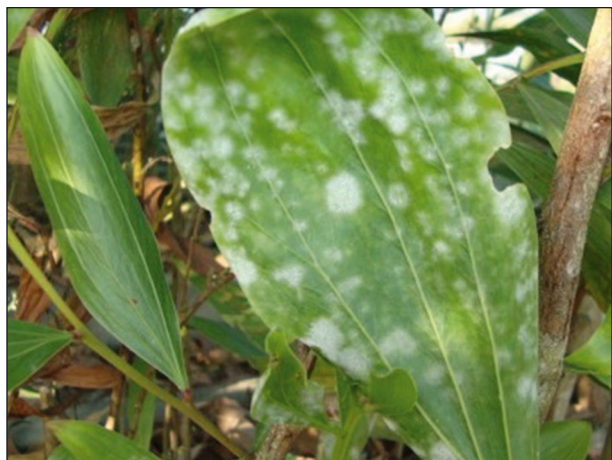
Fig. 1. Powdery mildew symptoms on A. mangium leaves

The disease was not severe in the studied area but leaflets were affected to a great extent in shade house conditions. As a result of infection, the surface of leaflets and phyllodes were completely covered with spores and mycelium which might affect physiological functions such as photosynthesis and transpiration leading to slow