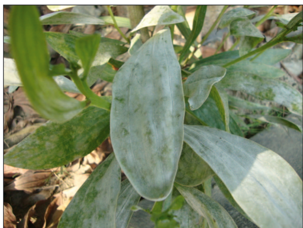
Fig. 2. Powdery mildew symptoms on A. mangium leaves