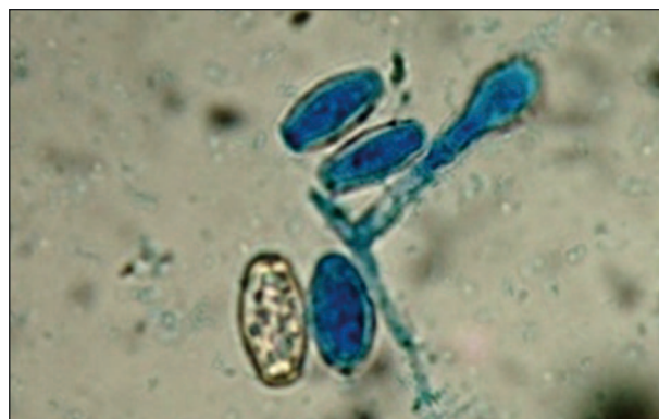
Fig. 4. Conidiophores and conidia