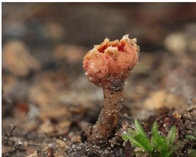
Fig. 4 Ascoma of Microstoma protracta from Krakow-Tyniec, fot. Radosław Kubiński.