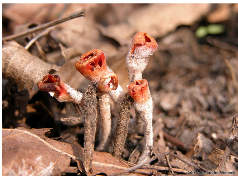
Fig. 3 Ascomata of Microstoma protracta from Czeszewo.

Locality 2. Krakow-Tyniec, Bielańsko-Tyniecki Landscape Park, in private forests at the eastern border of forest compartment 277b (Myślenice Forest District, Radziszów Forest Range), ATPOL DF-78, 2017-04-09, leg. & det. Radosław Kubiński.