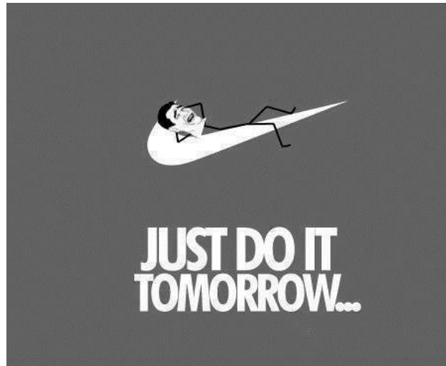
Figure 6. Nike's meme.

The company's aim was to make an entertaining advert to spread quickly among the consumers. It can be assumed that Nike has used the Rage Comic Meme to show that the company is part of the Web culture. The Rage Comic Meme is a humorous form of online communication with the consumer.