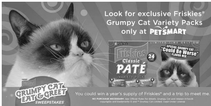
Figure 2. Grumpy Cat meme.

Grumpy Cat is a well-known meme which presents a photo of a cat with a dissatisfied face, usually with amusing phrases around, for example 'If you're happy and you know it, go to Hell.' The meme has become an Internet sensation and won itself many fans. Marketers have successfully used the Grumpy Cat meme in order to create a buzz and generate a content that consumers will respond to. For instance, Friskies, one of the cat food companies, has used the Grumpy Cat meme to promote their brand (Fig. 2). The meme establishes an emotional connection with the consumer by using humour.