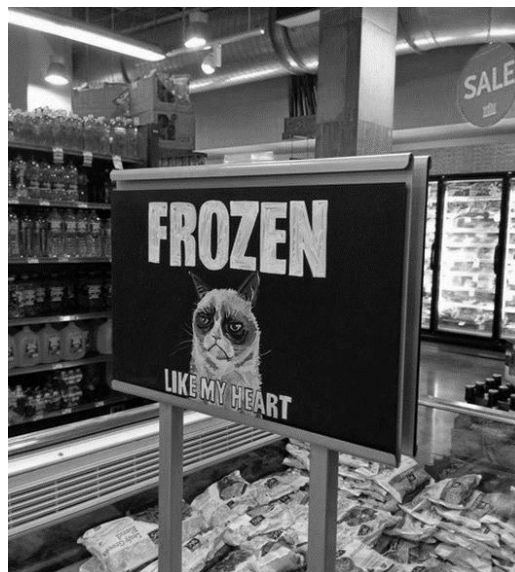
Figure 3. Grumpy Cat in the shop.