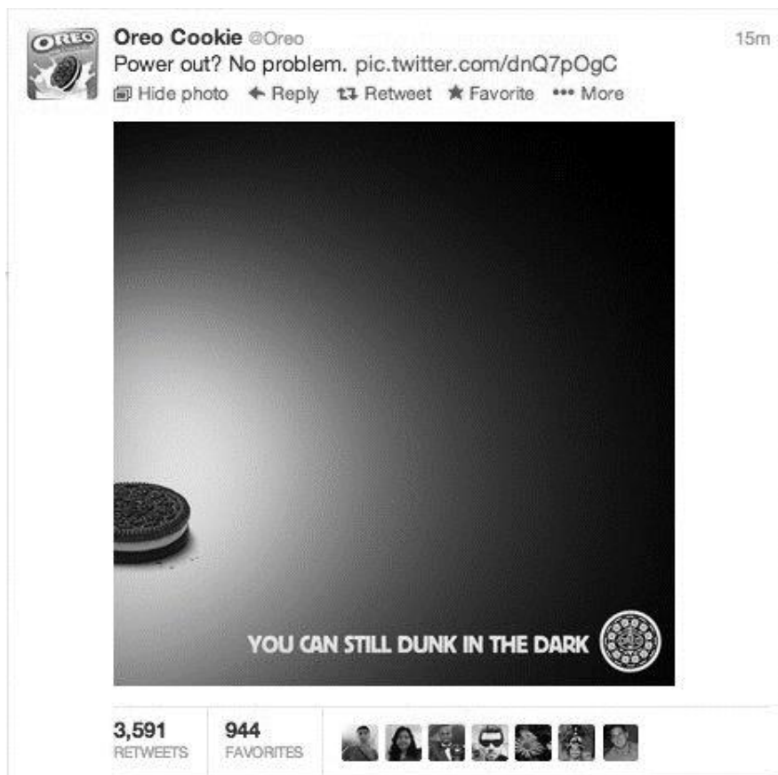
Figure 4. Oreo Cookie Meme

Keeping track of some popular cultural events may help marketers to stay on top of the Internet culture. For instance, Oreo became massively famous on social media during Super Bowl in New Orleans. The Oreo company referred to the power blackout in the Superdome by tweeting the below meme that read 'Power Out? No problem.'