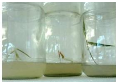
Propagules in MS Media 1