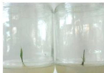
Propagules in MS Control Media