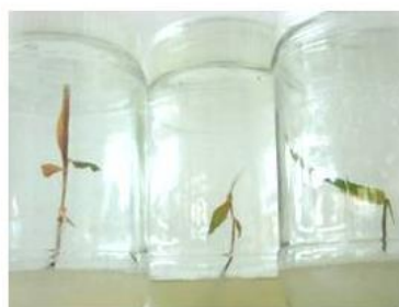
Propagules in MS Media 4