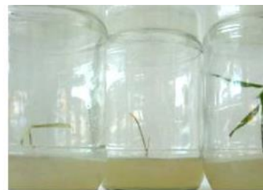
Propagules in MS Media 3