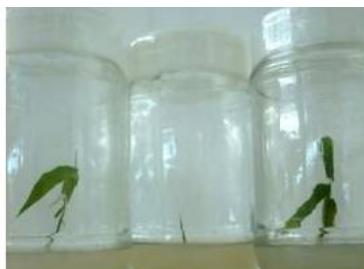
Propagules in MS Media 2