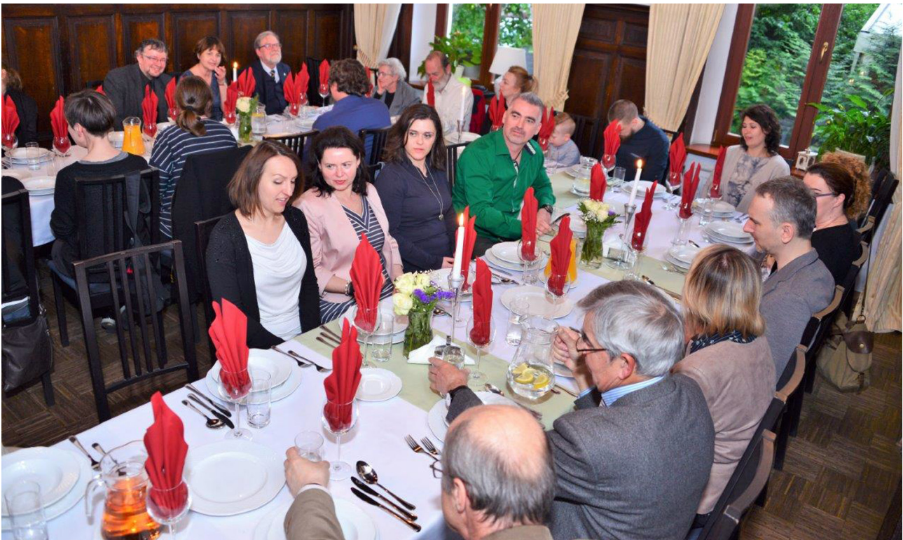
Fig. 3. Banquet.

The programme contained 20 oral presentations and 9 posters, making a total of 29 contributions (thus the poster:presentation ratio was ca. 1:2, much smaller than during any of our local seminars (0.9:1), and even more so, compared to the EuroMal (3.7:1). The contributions were distributed among the sessions with only a vague topical division, plus poster session. One presentation was a memorial for the recently departed ANDRZEJ WIKTOR; for obituary see Folia Malacologica 2019. All the presentations were good, but I am always especially glad to see young, beginner malacologists deliver surprisingly good papers, in this case two very good ones by two of our colleagues from Berlin: KATHARINA and PARM VIKTOR VON OHEIMB (obviously yet another malacological couple). Another one I liked very