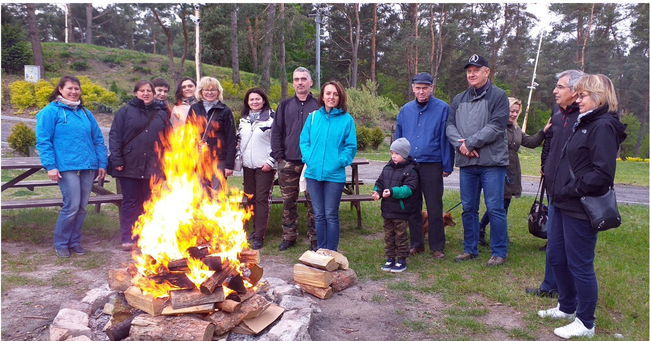
Fig. 4. Seminar bonfire.

The snail:bivalve ratio was 2.3:1 (the mean ratio for the EuroMal 1.3:1), the land:water ratio was 1.6:1 (a novelty: among aquatic presentations the freshwater:marine ratio was 2:1; previously we had hardly any marine contributions). The ratio of one-author contributions to contributions with two or more authors was 1:1 (less than during a few previous Seminars), and the numbers of papers/posters presented by girls versus boys were: girls 12, boys 6, mixed teams 11. The numbers of international contributions vs. all-Polish contributions were 5 and 24, respectively.