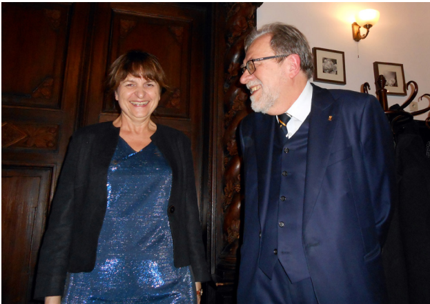
Fig. 5. Two very happy malacologists.

The attractions included a bonfire with a very good barbecue (superb chicken legs!) on a hill just outside the city, a sightseeing tour around the city and a banquet (during which we acquired one more honorary member).