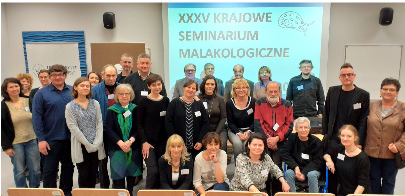
Fig. 1. Participants of the 35th Polish Malacological Seminar.

The Book of Abstracts was edited by JAROSŁAW KOBAK and TOMASZ K. MALTZ, and published by our always-on-duty publisher JAREK BOGUCKI (Bogucki Wydawnictwo Naukowe). Cover design by JAROSŁAW KOBAK, cover photos by BRYGIDA WAWRZYNIAK-WYDROWSKA, Seminar logo by MAŁGORZATA BAŃ.